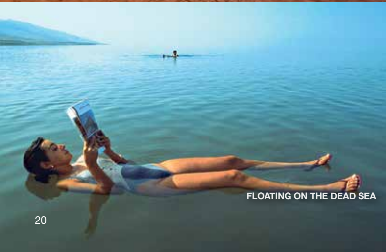
FLOATING ON THE DEAD SEA

Your vacation ends with breakfast this morning (the nearest airport is Tel Aviv). (B)