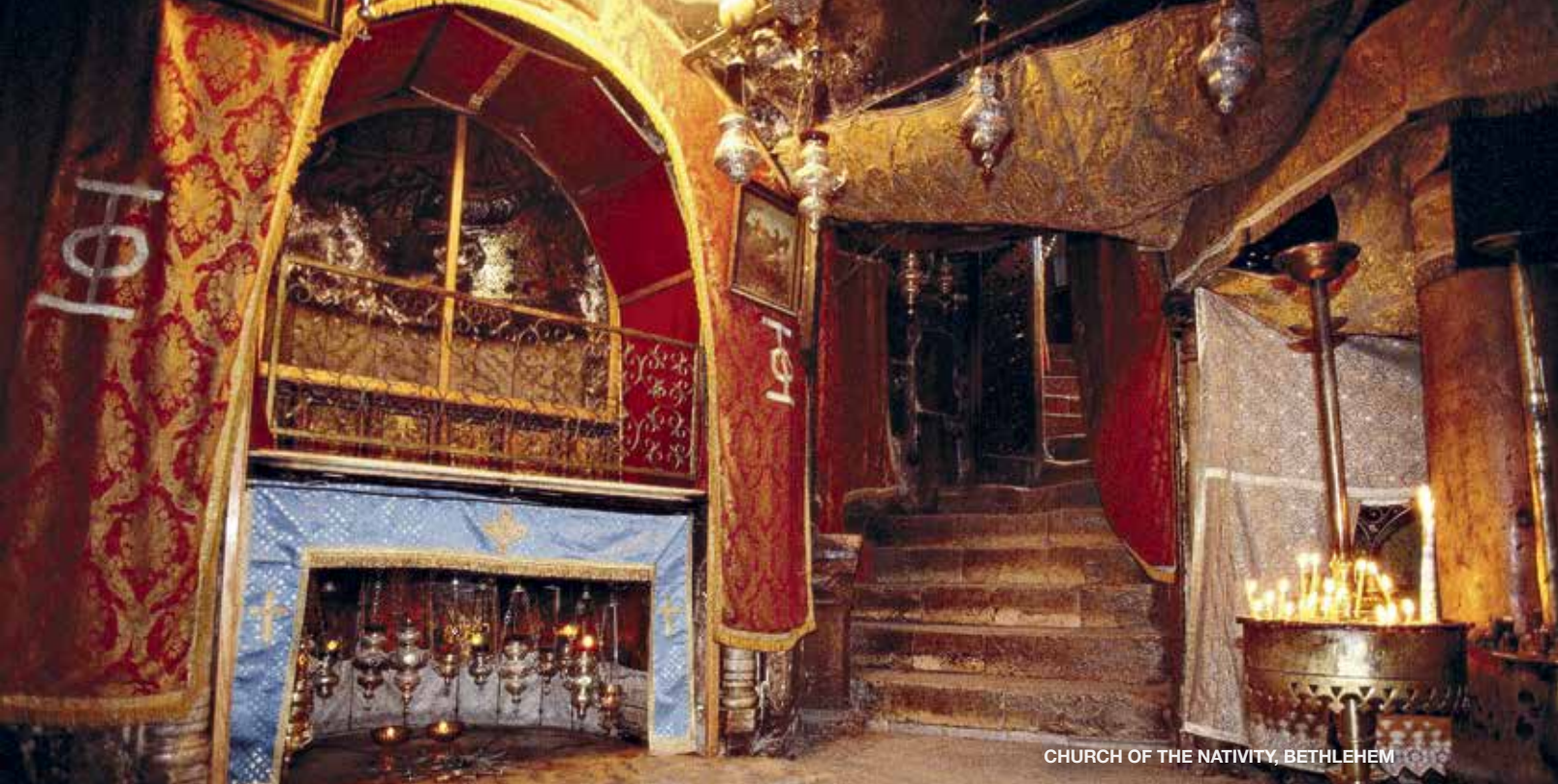
CHURCH OF THE NATIVITY, BETHLEHEM