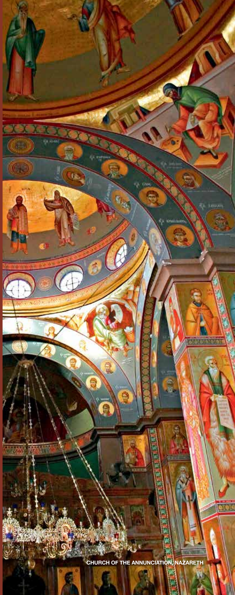
CHURCH OF THE ANNUNCIATION, NAZARETH

Please check visa requirements with your local consulate(s); responsibility for obtaining visas rests with the traveler.