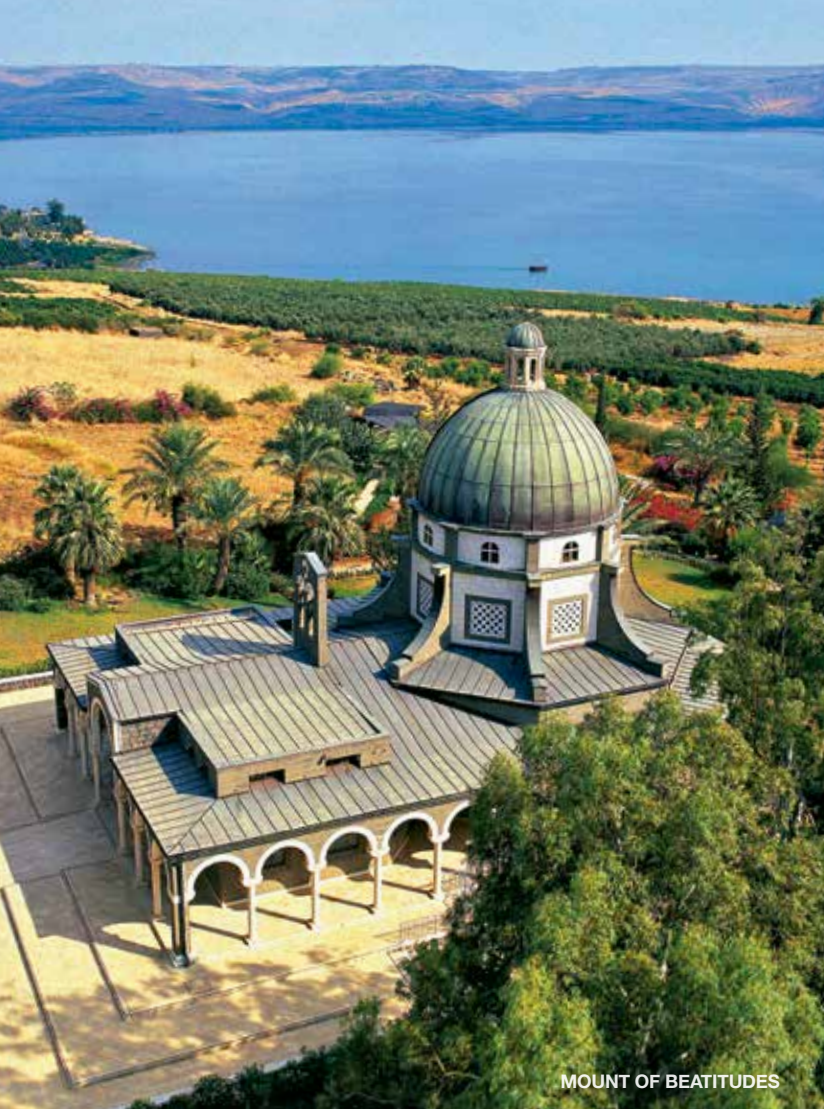
MOUNT OF BEATITUDES