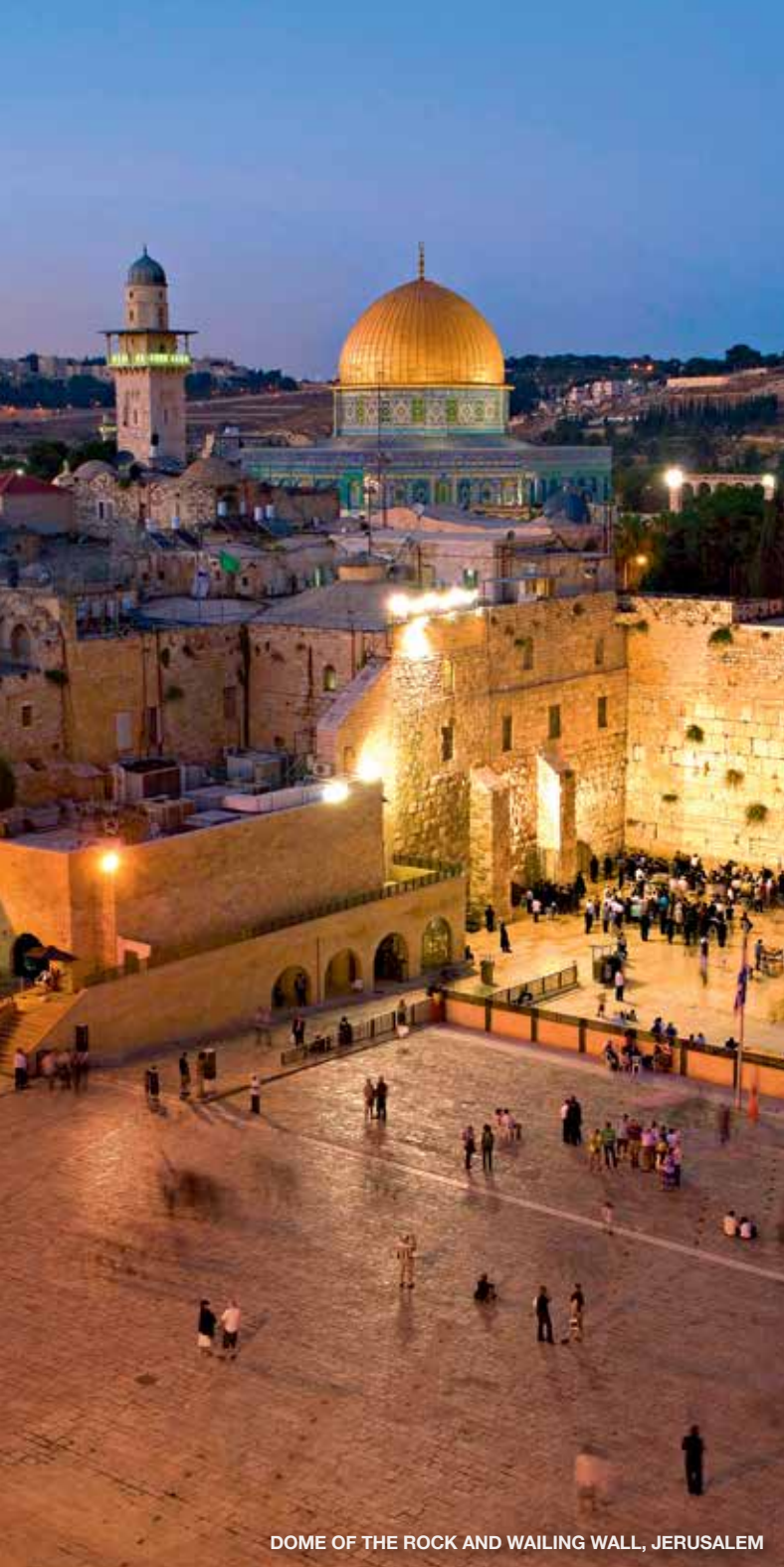
DOME OF THE ROCK AND WAILING WALL, JERUSALEM